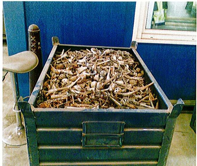
above: A typical bin full of recycled implants at OrthoMetals new factory located at Zwolle, The Netherlands